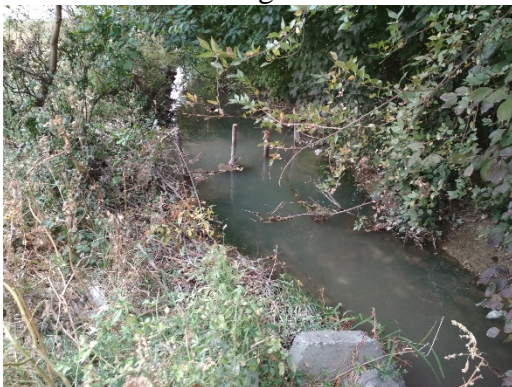
Unlined canal P-4-X-2