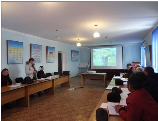
Meeting of the Technical Council of the Jalal-Abad OVK