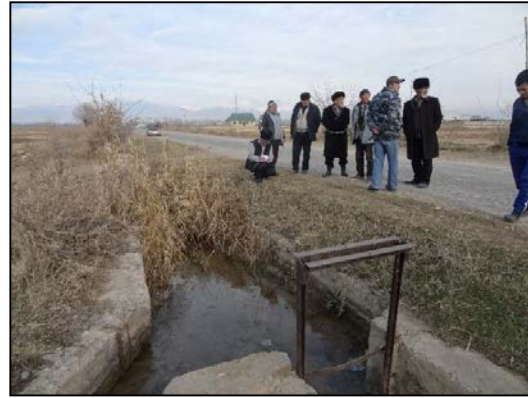
Survey of on-farm canals of WUA