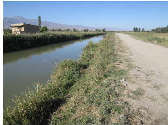
Big Talas Canal