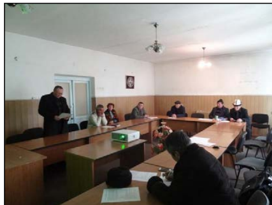
Meeting of the Technical Council of the Osh OVK