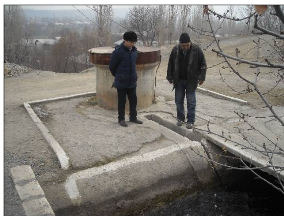
Survey of off-farm canal Kojo-Kayir