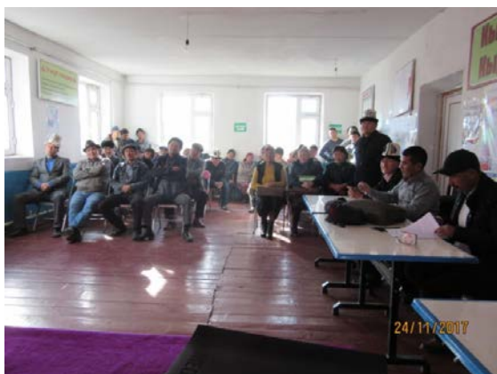
Public hearings in WUA Jylaldy-Uzgen, Uzgen rayon, Osh oblast

All participants of public hearings supported the implementation of the project. Based on the results of public hearings, minutes were drafted and signed by the participants, which were attached to EMPs.