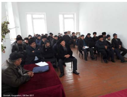
Public hearings in WUA Gauyan Kadamjai rayon, Batken oblast

In order to inform the state authorities on environmental requirements during the project implementation, a presentation for the workshop was prepared, which was held on November 27, 2017. In the presentation it was provided information on: