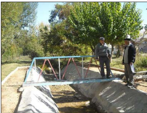
Survey of on-farm canals of the WUA Kurshab-Arzybek