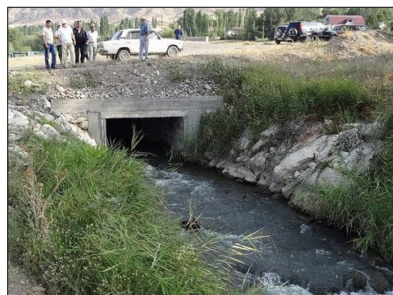
Survey of off-farm canal Shakaftar