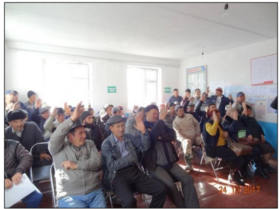
Zonal representatives of WUA Jylaldy-Uzgen having elected the rehabilitation option