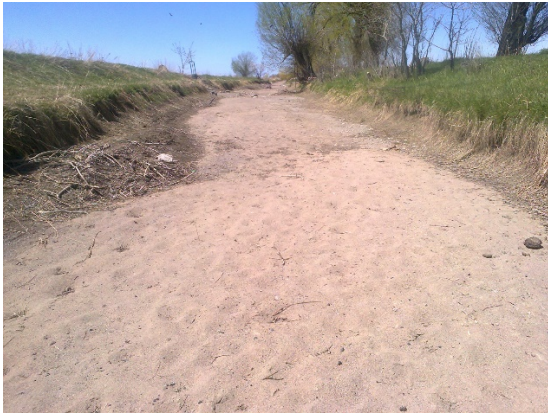
The section of the Komsomolsky Canal for the designed hydropost on the boundary of the WUA Jayilma-Shapak and HM 78 + 78

On the Komsomolsky Canal, the design provides for rehabilitation of old hydroposts with installation of 8 control and measurement structures, construction of 9 new hydroposts including installation of control and measurement structures, construction of 7 water outlets, mechanized cleaning of existing off-farm drain of 4.4 km and construction of 3 cross regulators and 1 hydropost.