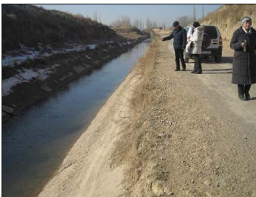
Survey of off-farm canal Aravan-Ak-Buura canal