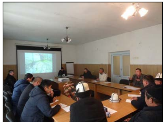
Meeting of the Technical Council of the Batken OVK