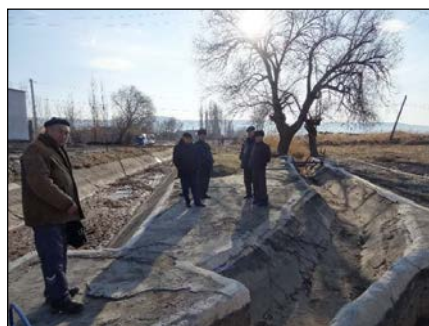
Survey of off-farm canal Levaya Magistral