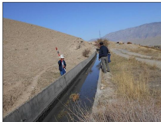
Topographic survey of on-farm canals of WUA Kyrk-Bulak