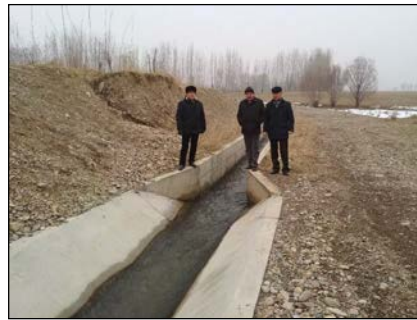
Design engineers for northern region at head structure of Mady-Sai River in WUA Sultan-Naz of Osh oblast