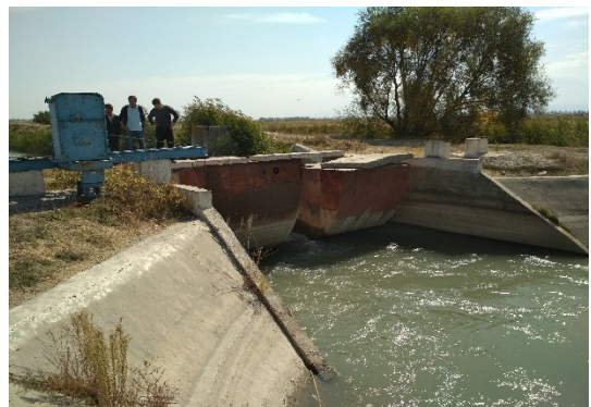
Retaining structure at HM 25+00