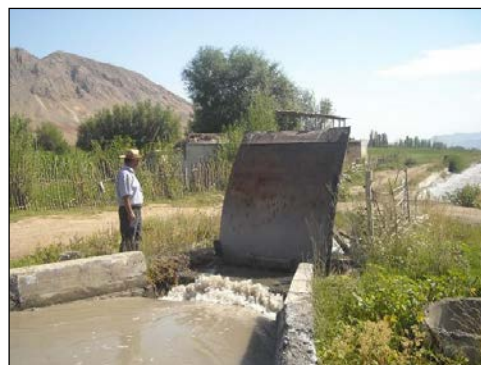
Survey of on-farm canals of WUA

Also, under the NWRMP-1, 6 pilot schemes were identified, in which the rehabilitation work will be carried out on the following systems: