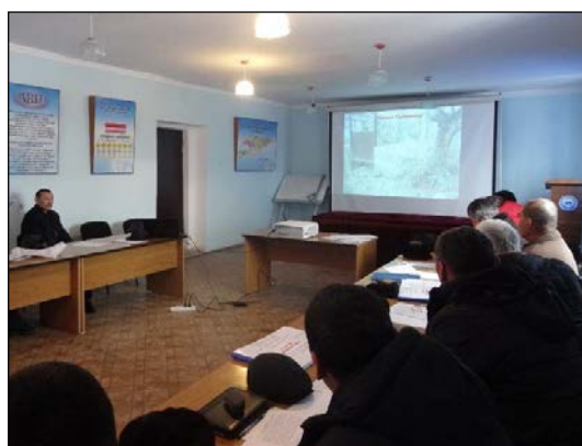
Meeting of the Technical Council of the Jalal-Abad OVK