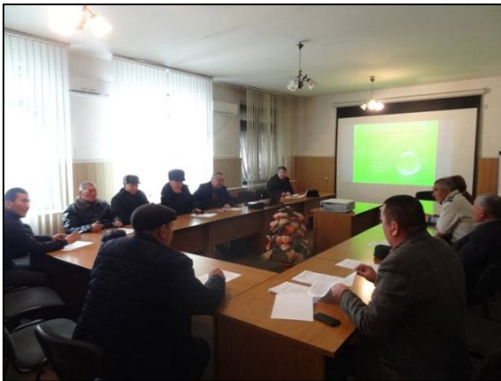
Meeting of the Technical Council of the Osh OVK

In accordance with the schedule of design works, a meeting of the Technical Council of the Osh OVK was held with the participation of the APNIP PIU specialists and the WUA "Jylaldy-Uzgen", which reviewed the detailed documentation and drawings of the sub-project "Rehabilitation of the irrigation system of the WUA " Jylaldy-Uzgen". Moreover, zonal representatives of WUA "Jylaldy-Uzgen" have elected the final option of the rehabilitation of the irrigation system of the WUA, have voted for repayment of 25% of amount of rehabilitation costs.