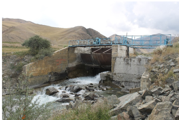
Headworks on the Bashkeltebek River