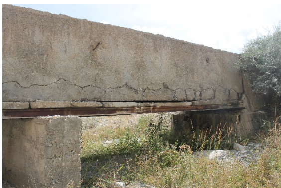
The aqueduct across the Kara-Koin River

rehabilitation of on-farm canals and structures. After the rehabilitation, farmers will receive the required amount of water and, accordingly, crop yields will increase. The planned rehabilitation measures will allow passage through the canal of the required amount of water, establish water accounting, ensure water distribution.