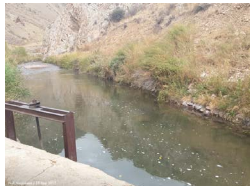
Regulator subject to reconstruction in WUA Jylaldy-Uzgen