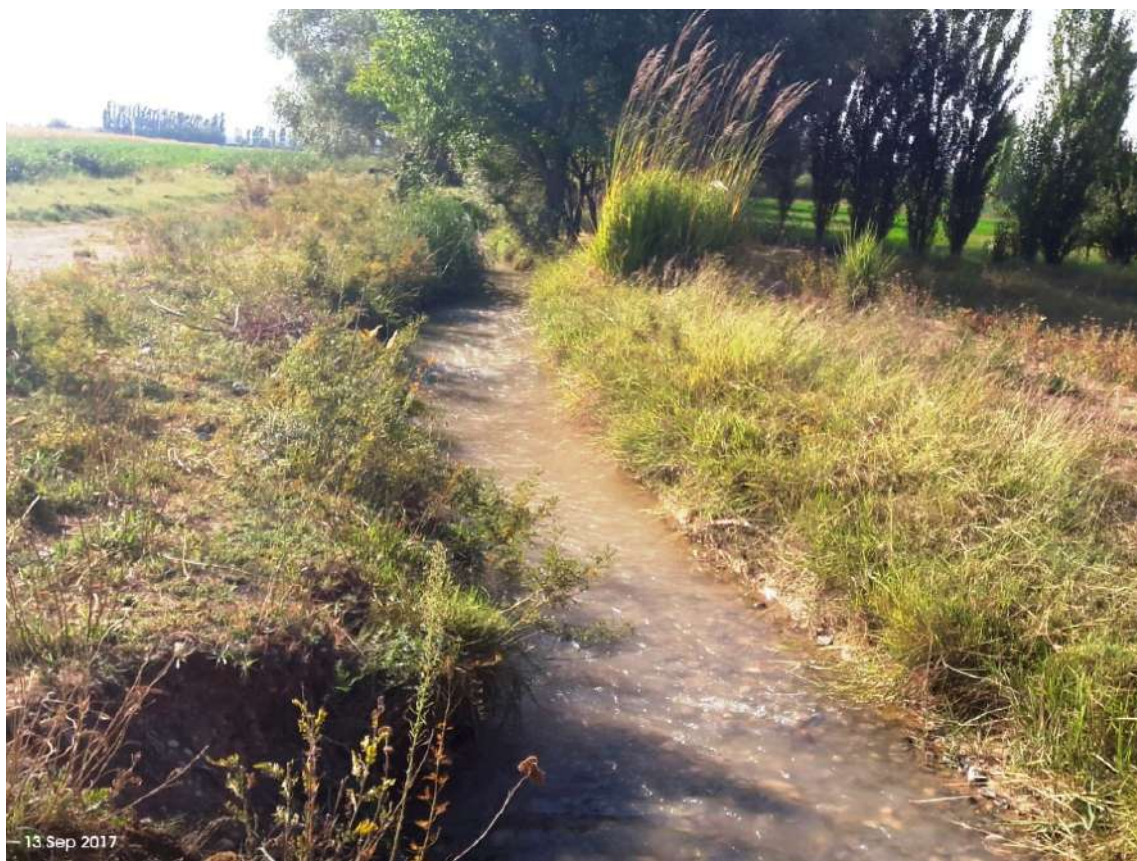
Picture1. Earth-bed canal «Taymonku», 13 September, 2017