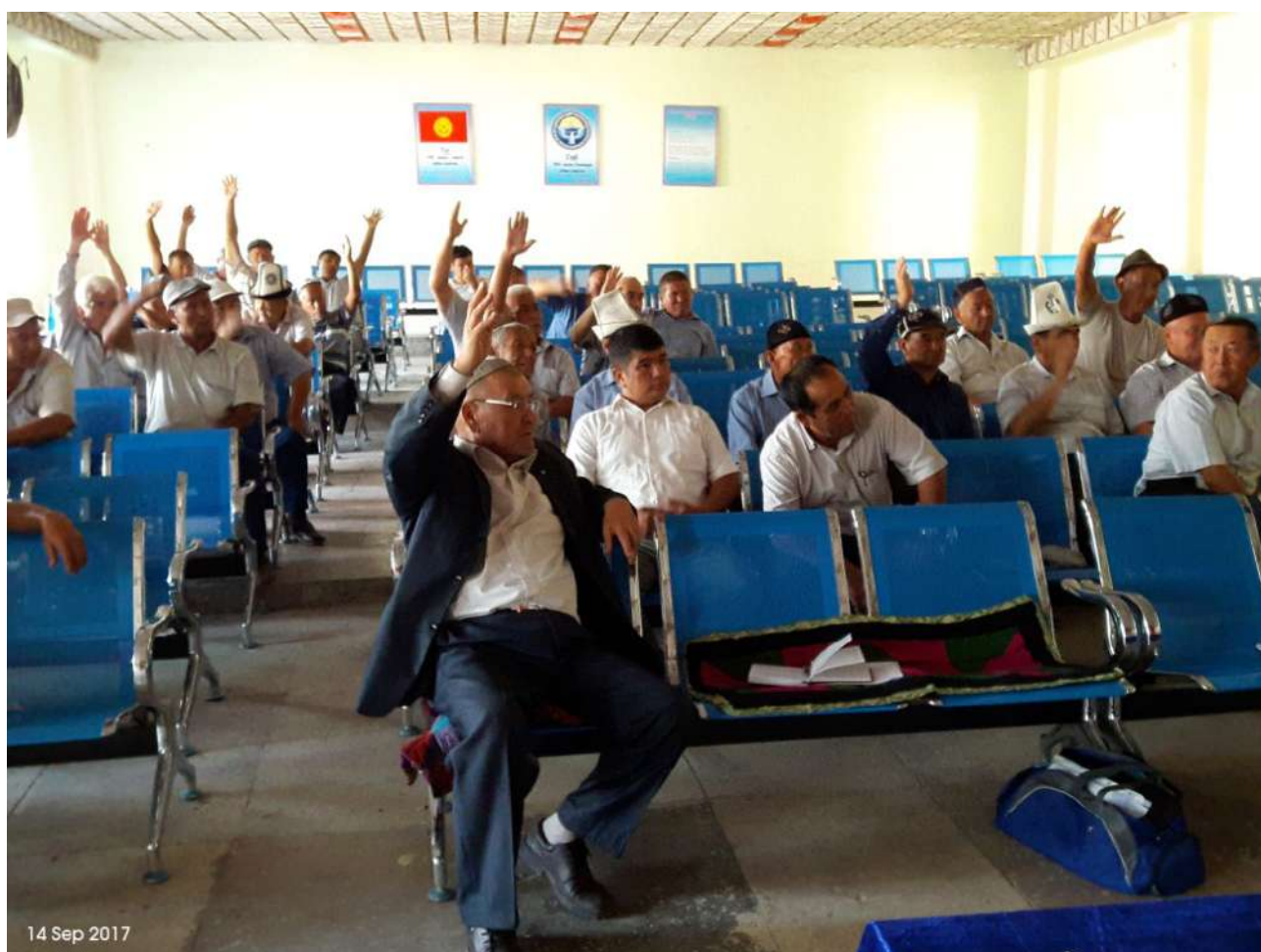
Фото 6. Public hearing in village Arimjan WUA «Taymonku», 13 September, 2017