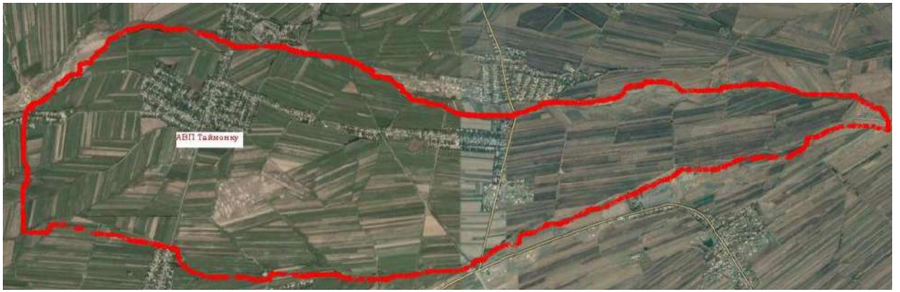
Picture1. Overview of WUA “Taymoku” location