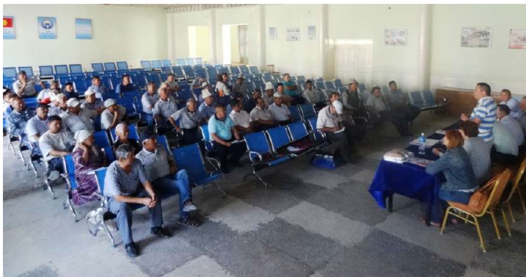
Picture 5. Public hearing in village Arimjan WUA «Taymonku», 13 September, 2017