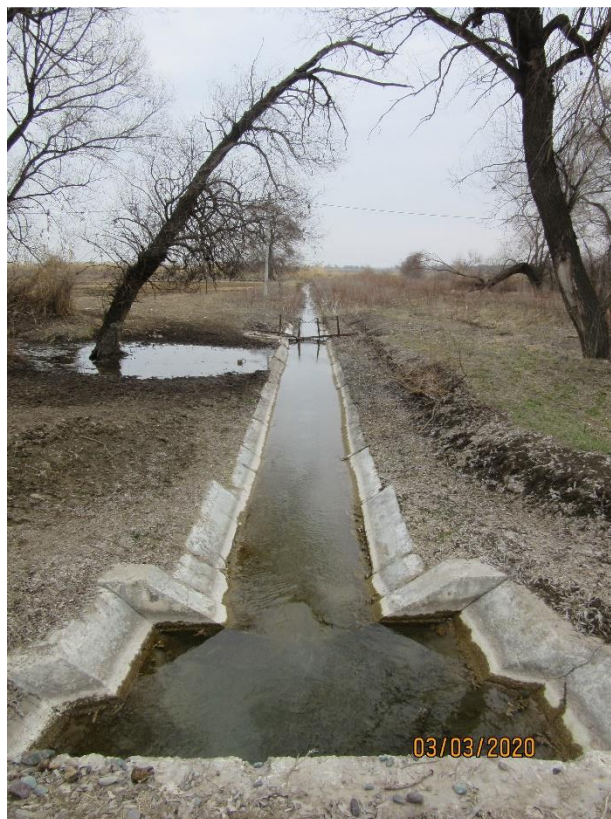
№2. Off-farm c-p Verknny. March 2020.