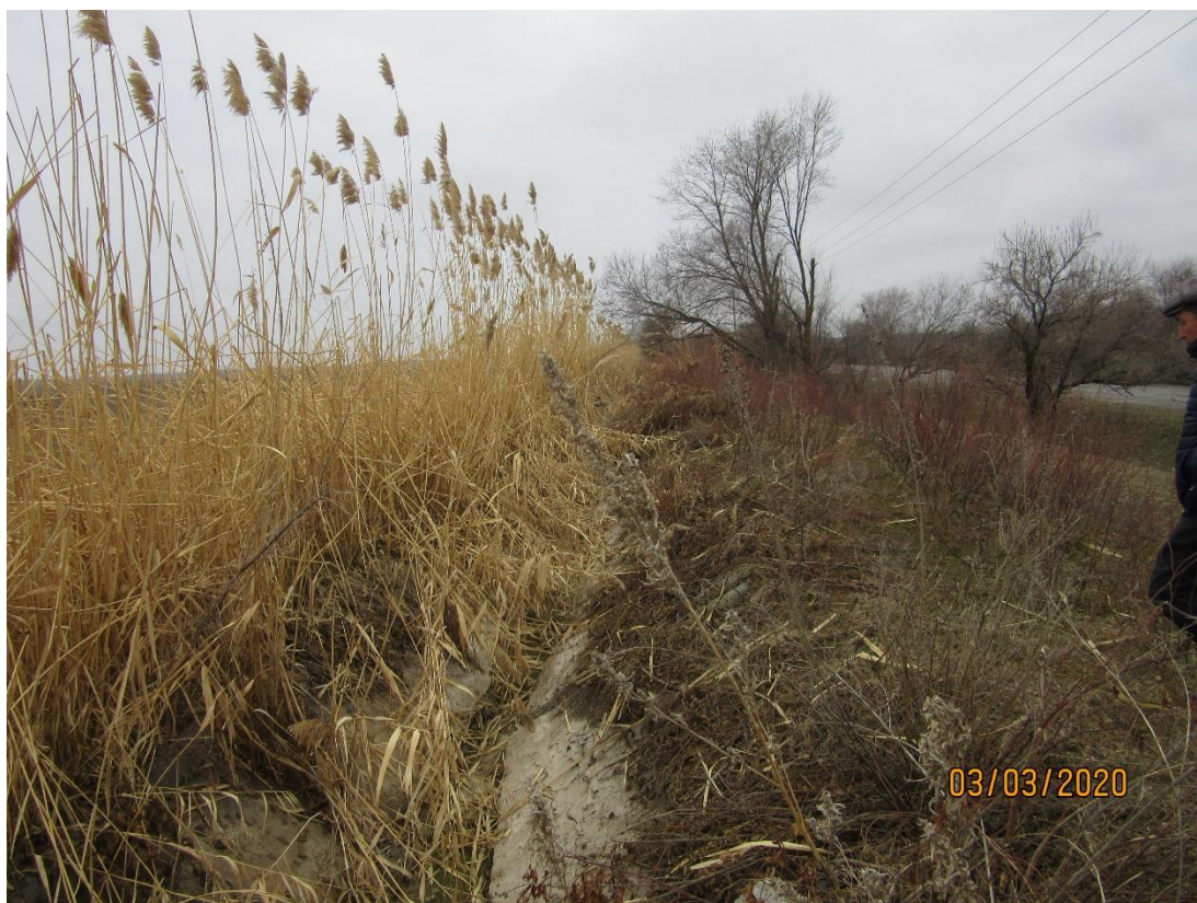
№4. On-farm c-l CX-1-2. March 2020.