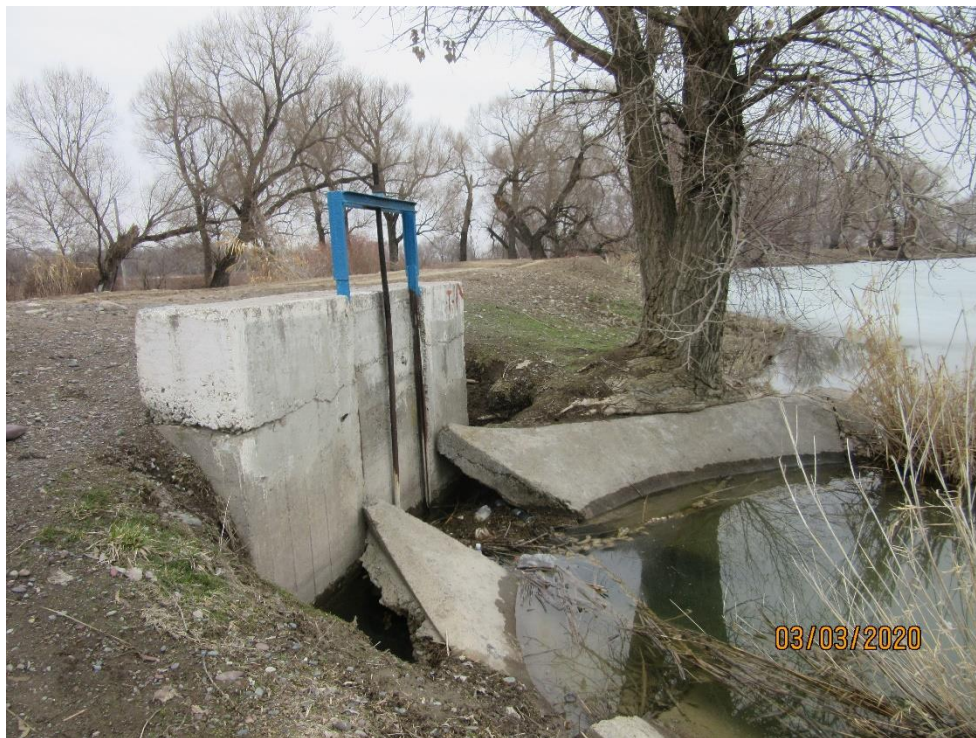
№1. Shutter gate on DSR Stepninsky, March 2020.