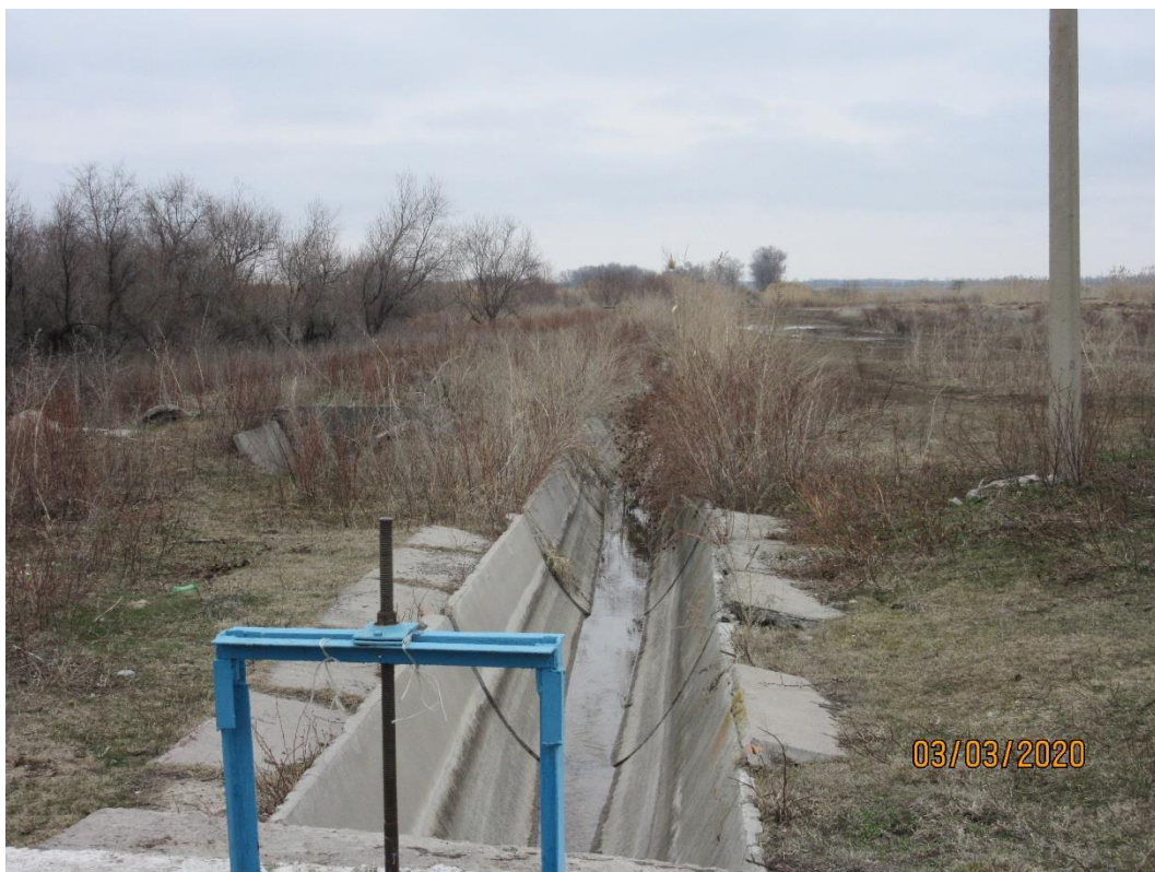
№3. On-farm c-l CX-1. March 2020.